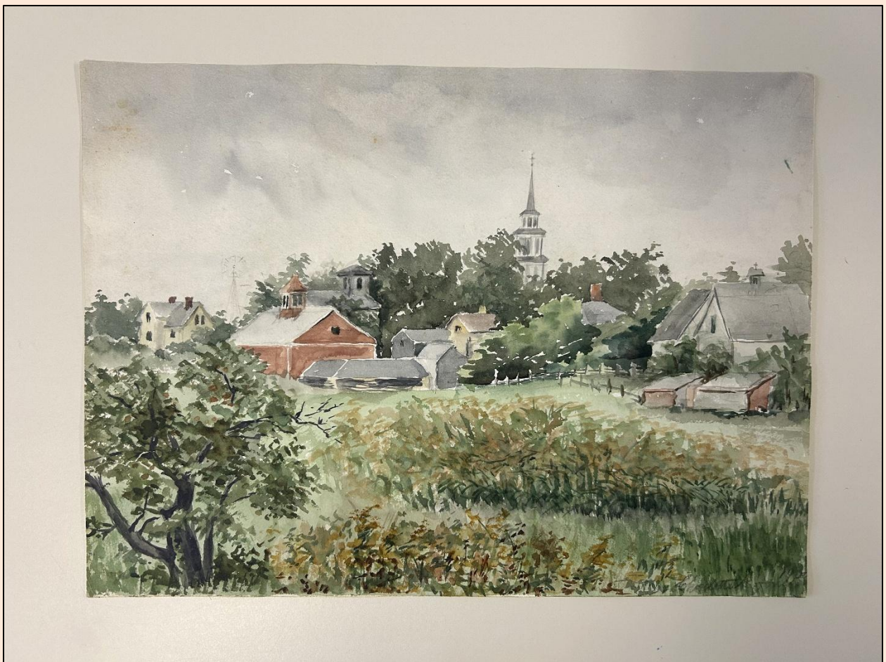
BOYLSTON CENTER PAINTING BY CHARLOTTE JONES #1973.48

The Boylston Historical Society has two paintings by Charlotte, painted from vantage point of the Coffin property on Scar Hill Road, both painted around the 1910s. Both are sketches that were painted over with watercolor. The first one BHSM Collection #1973.48 is depiction of Boylston Center. The view from the property is not blocked by forest as it is today, giving as a clear view of the buildings. Can you guess which ones they are? The red chimney protruding out of the bushes just to the right of center would be the Hastings Tavern. Right behind the other red building, the greyish blue building would be the Town Hall (today’s Historic Town Hall, the home of the Boylston Historical Society!). Behind the Town Hall, we are seeking to determine if the structure in the distance is one of the engineering benchmark control points for the Wachusett’s Reservoir construction or a windmill for pumping water? Please email us at info@boylstonhistory.org , if you have any knowledge about this structure. The steeple shown in the center background would have been on the Third Meeting House, the current day location of the Boylston Congregational Church!